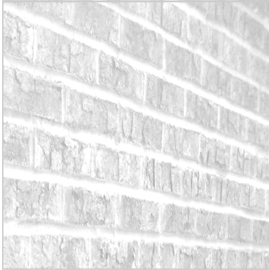
The Barrier Test